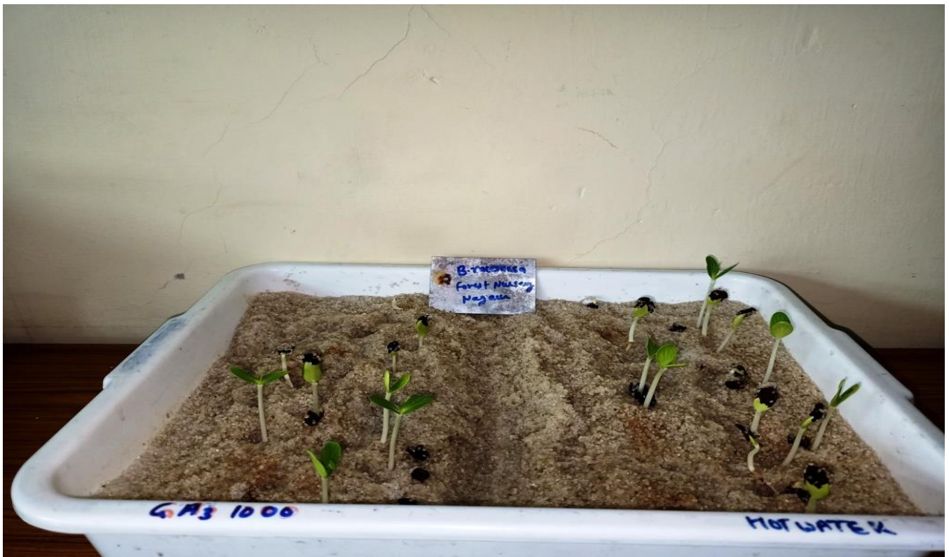
Figure 3. Seed germination of Bauhinia racemosa