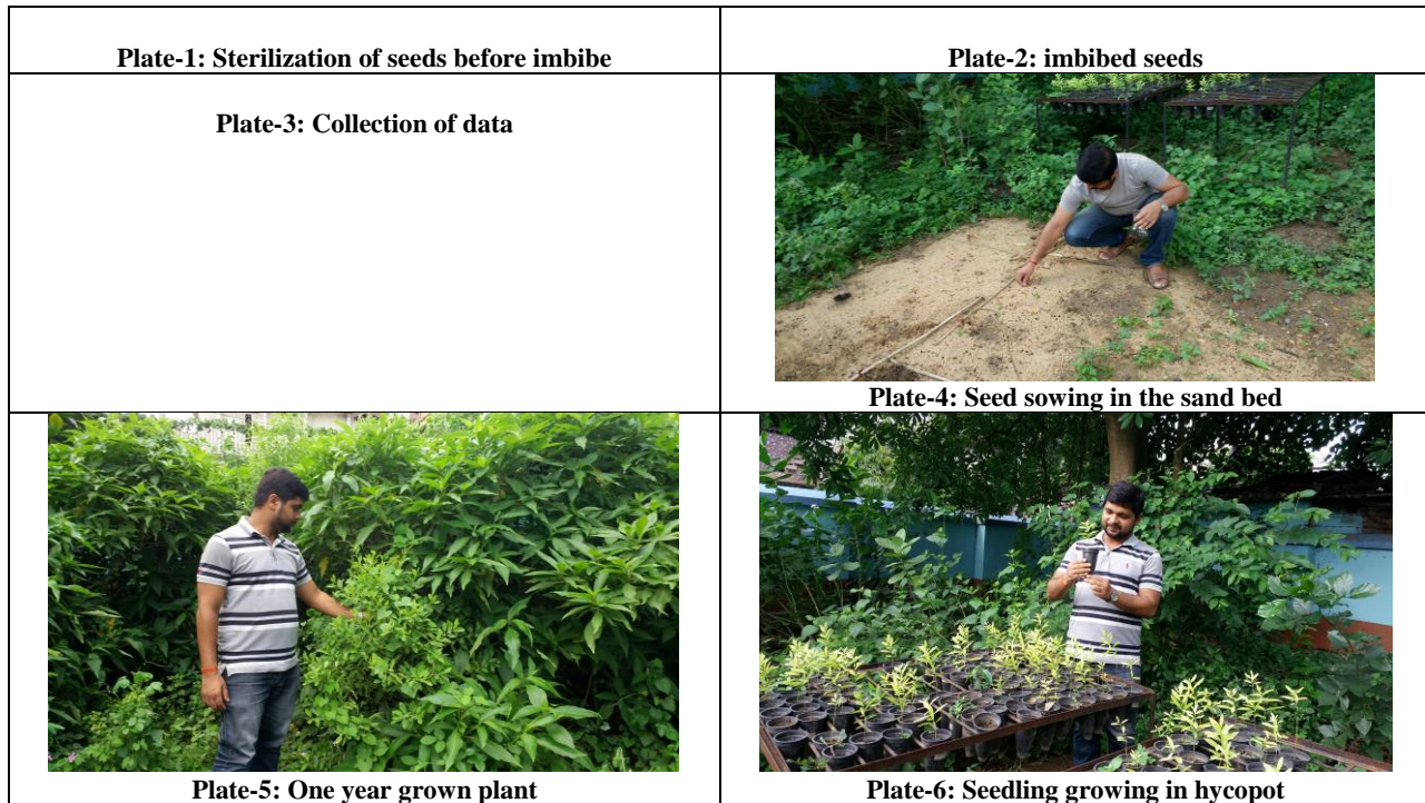
Table-V: Some field photographs